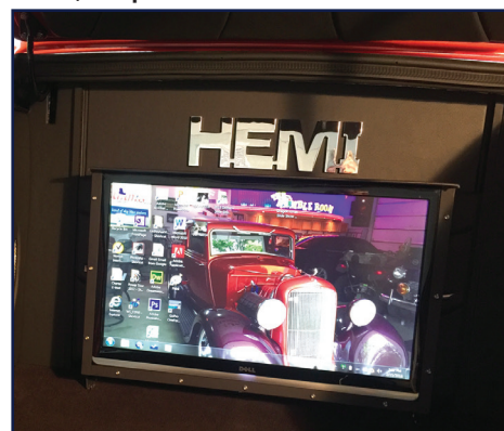
During car shows, a TV in the trunk shows the process.